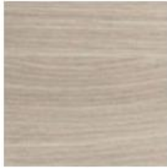
Chêne fil N